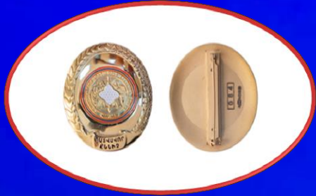
Pin Badge "Honorary Investigator"