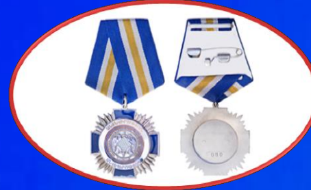
Medal "For Devotion and Courage"