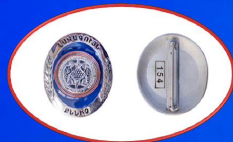
Pin Badge "The Best Investigator"