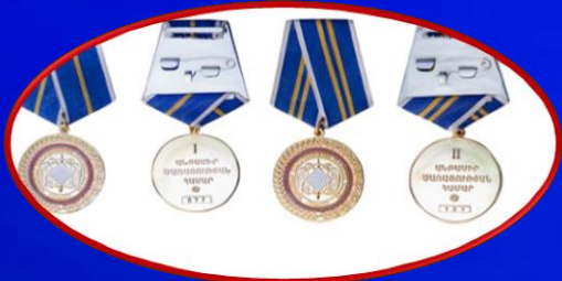
Medal "For Impeccable Service"