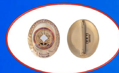
Pin Badge "Honorary Partner"