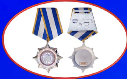
Medal "For Loyalty"