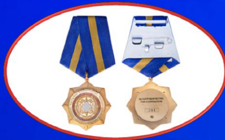
Medal "For Cooperation"