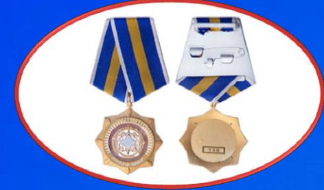
Medal "For Merit"